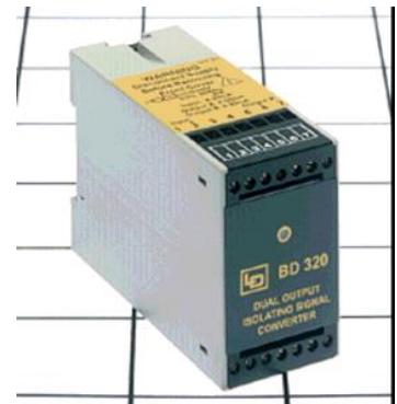
Photograph representative only

Option: The BD371 is a 48 Volt AC powered version with a 21 Volt DC transmitter power supply.